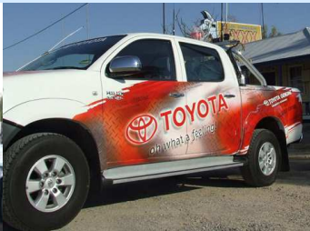
Oh, What a Feeling!