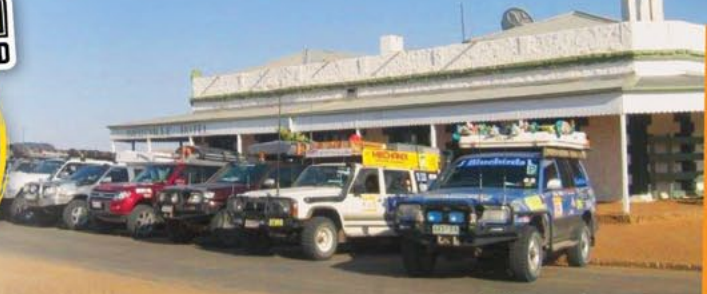
Birdsville Hotel, Lay Day.