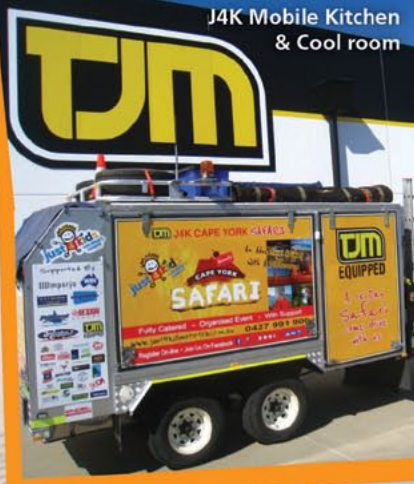
J4K Mobile Kitchen & Cool room

Join us for the adventure of a lifetime! A 11 day trek that includes the Simpson Desert Crossing Sunday 25th May - Wednesday 4th June 2014