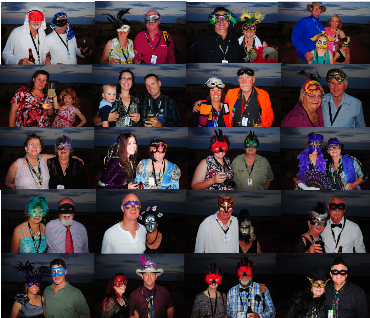
THEY CAME DRESSED UP TO THE ULURU MASKED BALL AND WHAT A NIGHT IT WAS—GREAT FUN FOR ALL!!!