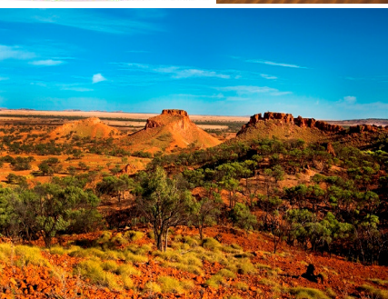
CARISBROOKE STATION ESCARPMENT

Our 2nd motor trail event for 2013 is the 10 day Dinosaur Trail , which will commence with a Meet and Greet function at the Criterion Hotel in Rockhampton on Sunday 15th September before travelling to Clermont, Barcaldine, Winton (where you will follow the dinosaur trail ), Lark Quarry, Carisbrooke Station, cross the Diamantina Lakes into Bedourie, Birdsville ( wine and dine on top of Big Red ) before concluding in beautiful Blackhall on Wednesday 25th September . We have organised some amazing tours and community functions along the route. Registrations are open now so please book early to avoid disappointment. www.just4kidsmotortrail.com.au for entry forms and ALL relevant documents.