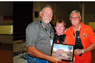
OVERALL J4K MT CHAMPS FUN NIGHT CHAMPS BEST LITTLE HELPERS THEME NIGHT CHAMPS