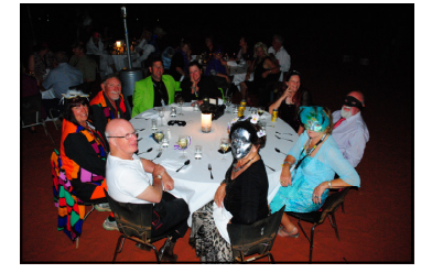
AS PRISCILLA THEY WENT ACROSS THE DESERT, TO RAISE THE FLAG AT LAMBERTS AND DINE AT ULURU