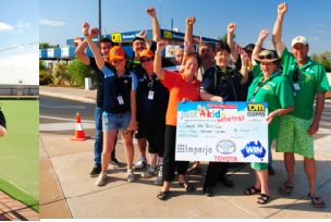
WE GAVE AWAY FUNDS CAUSE THAT'S WHAT WE DO, WHILST ENJOYING OURSELVES, A JOLLY GREAT CREW