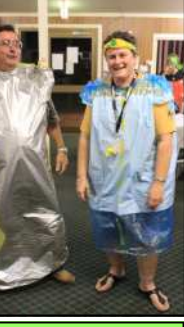
Recyclable fun at Jandowae