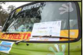
Winners & Grinners at Widgee School lunch