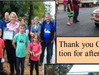
Thank you Coo-ee Station for afternoon tea