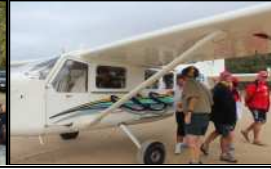
Fraser Island by plane - Scared??? Not us!!