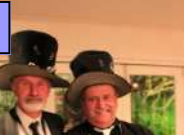
OUR FINAL NIGHT - B&W