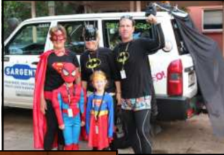
Golfing Super Heroes - fun stop champions.