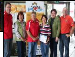
Ken Mills Toyota for breakfast - yum