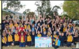
Rainbow Beach School rocks!!