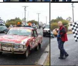
Ready set go - we're away again!