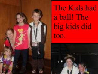
The Kids had a ball!! The big kids did too.