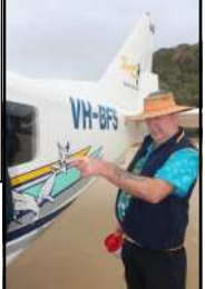
JTS sponsor day - Mmm!