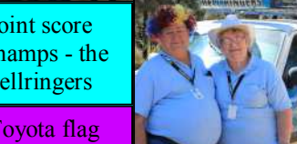
Point score champs - the Bellringers