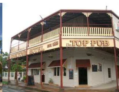
A fundraising night with Endeavour Lions to raise funds for the kids of Cooktown