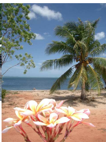
View from Seisia Caravan Park